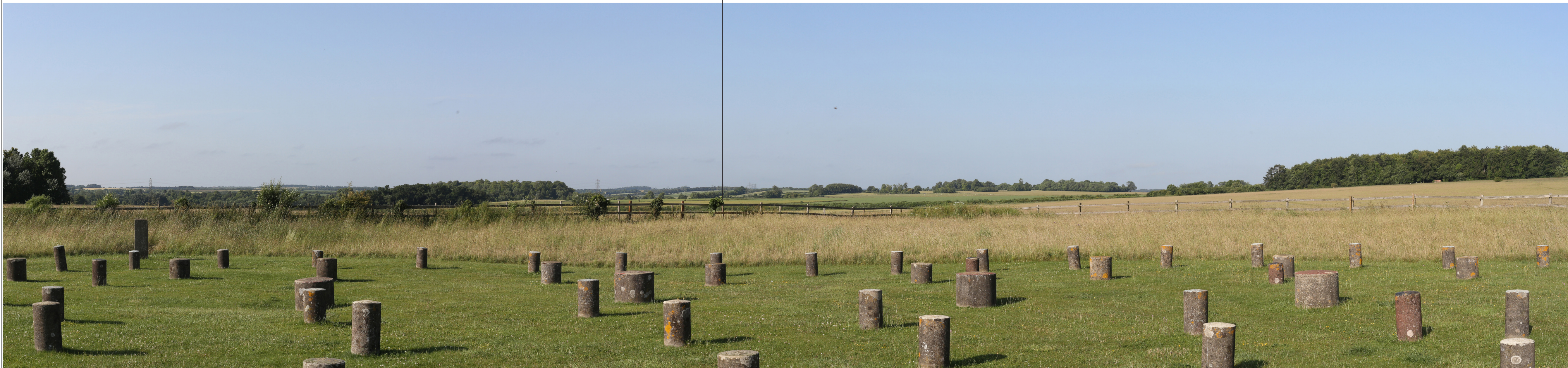
PROPOSED (SUMMER YEAR 15)